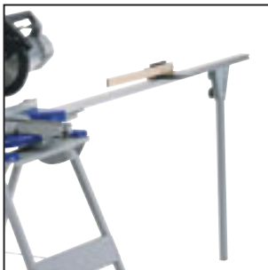
Table extension, right 1660 mm