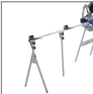
Table extension, left 3000 mm